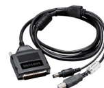
ML-PAR100 Parallel Connector