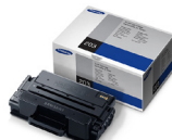
MLT-D203S Toner Cartridge 3K pages